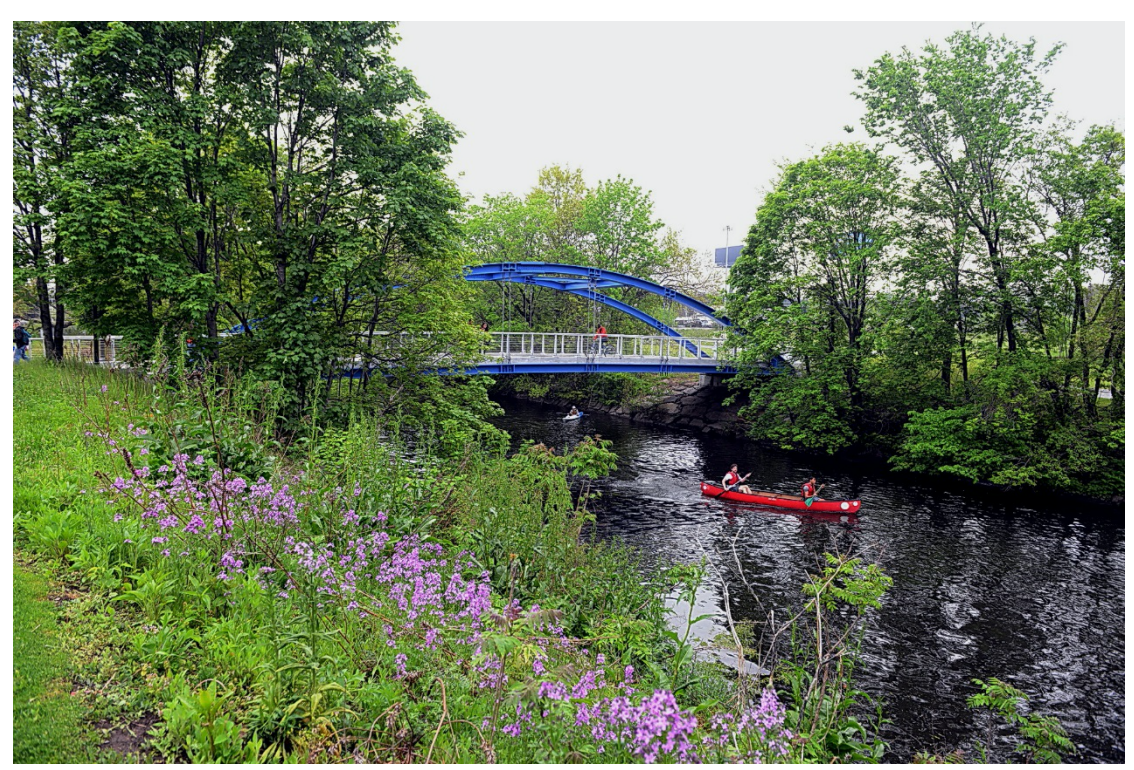
A restored section of the Bronx River Greenway in Starlight Park

(Bronx, NY – February 4, 2021) The NYC Department of Design and Construction (DDC) and NYC Parks announced today that Phase 2 of the project to construct a continuous greenway through Starlight Park in the Bronx has been selected to receive an Envision Gold Award from the Institute for Sustainable Infrastructure (ISI). The project is being managed by DDC for NYC Parks.