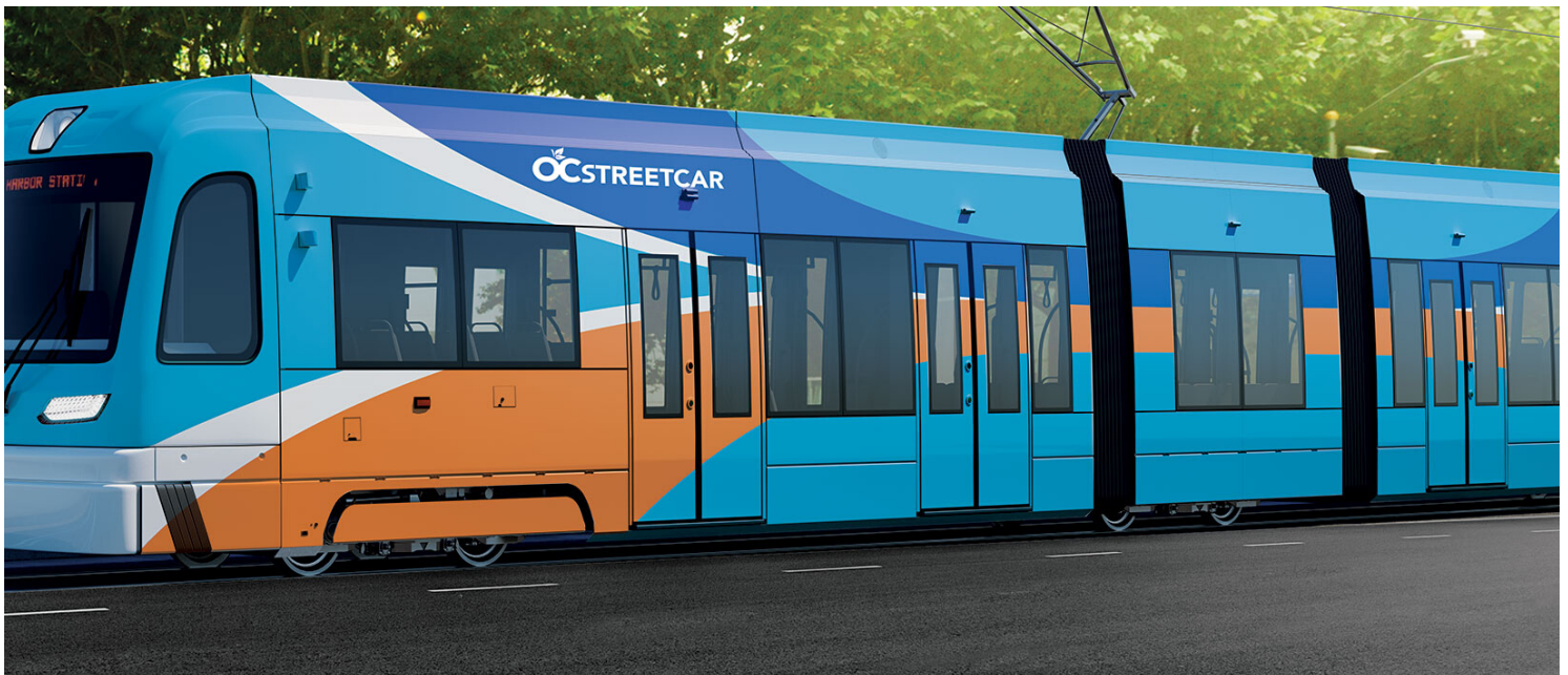
OC Streetcar Project, Orange County, CA — Envision Silver, 2019

In addition to those benefits, Envision recognizes and rewards genuine innovation in infrastructure that leads to healthier, more sustainable communities. For example, the Surrey Biofuel Facility in Surrey, British Columbia, was the first closed-loop fully integrated organic waste-to-energy infrastructure facility in North America. It processes residential and commercial organic waste into renewable natural gas—enough to fuel the city's natural-gas fueled fleet to achieve ambitious waste-diversion targets and reduce air pollution and greenhouse gas emissions.