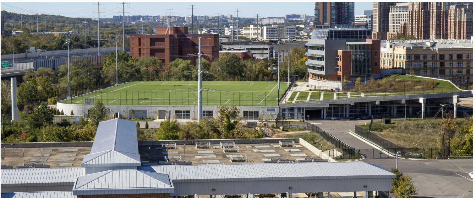
AlexRenew Nutrient Management Facility in Alexandria, Virginia

Imagine if they did. Imagine if all projects were planned and designed using Envision to deliver sustainable and resilient transportation, water, and energy systems. The positive outcomes that could be achieved are exciting to contemplate.