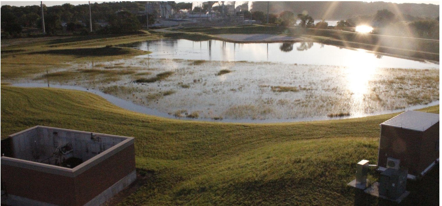
Cedar River Flood Control System, Cedar Rapids, IA— Envision Verified, 2017