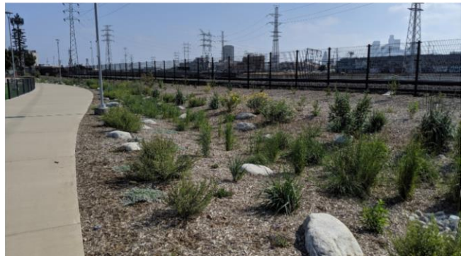
Top left: southerly view during construction; Top right: southerly view after completion; Bottom left: westerly view after completion; Bottom right: Bioswale.